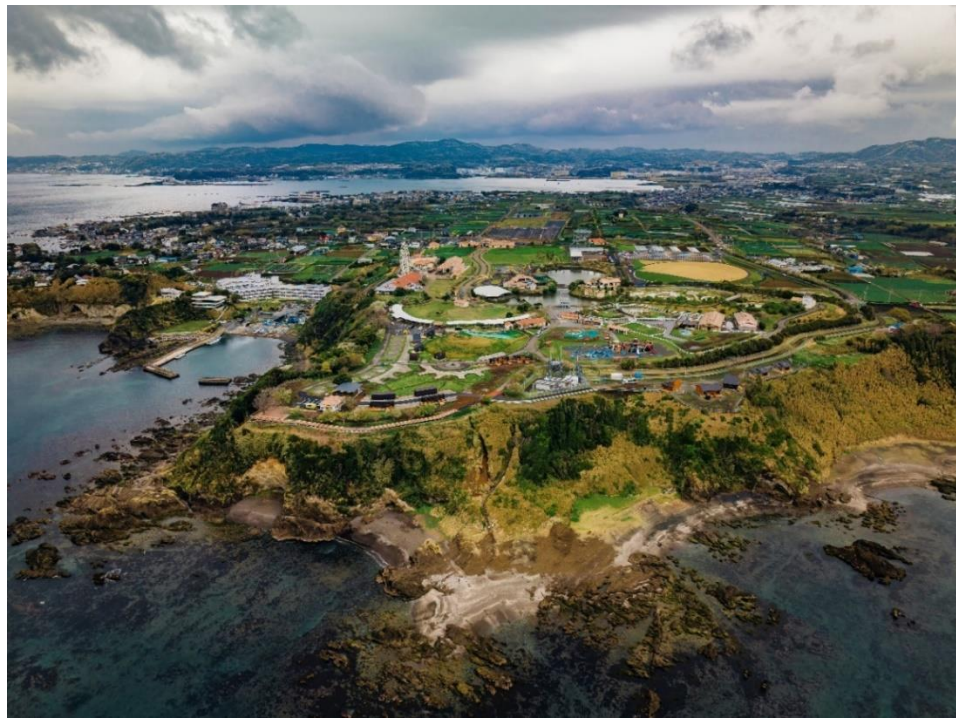
Nagai Uminote Park Soleil Hill, where Nakagin Capsules scheduled to be placed

Oshima, and Mt. Fuji. The park was renewed in Apr 2023 and have installed a new athletic facility in approximately 15 meters high that offers excellent views and thrills, as well as a zipline that takes off from it. In addition, the park also added glamping and new sites to camping area,., indoor sports facility (you can enjoy it even raining), a dog run, and more snack shops where they can eat while walking have been added.